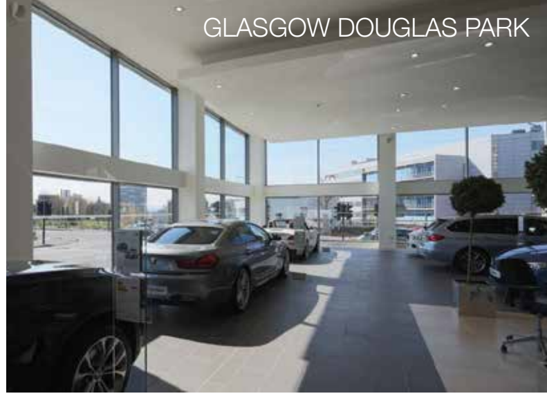
GLASGOW DOUGLAS PARK