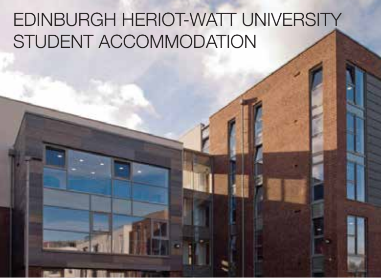
EDINBURGH HERIOT-WATT UNIVERSITY STUDENT ACCOMMODATION